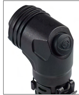
TEN-TAP® programmable switch with three user-selectable modes

Material/Lens 6000 Series machined aircraft aluminum with anodized finish. High temperature, shock-mounted, AR coated, impact-resistant BOROFLOAT® glass lens.