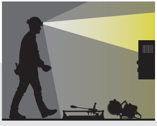
Dual-Light Technology, focused spotlight and area floodlight at the same time.