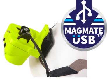
Magnetic Waterproof USB Coupling Never worry about water getting inside your headlamp.